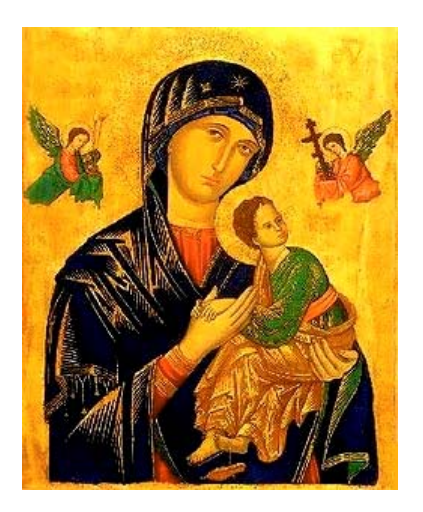
Icon of Our Lady of Perpetual Succour Rome Italy